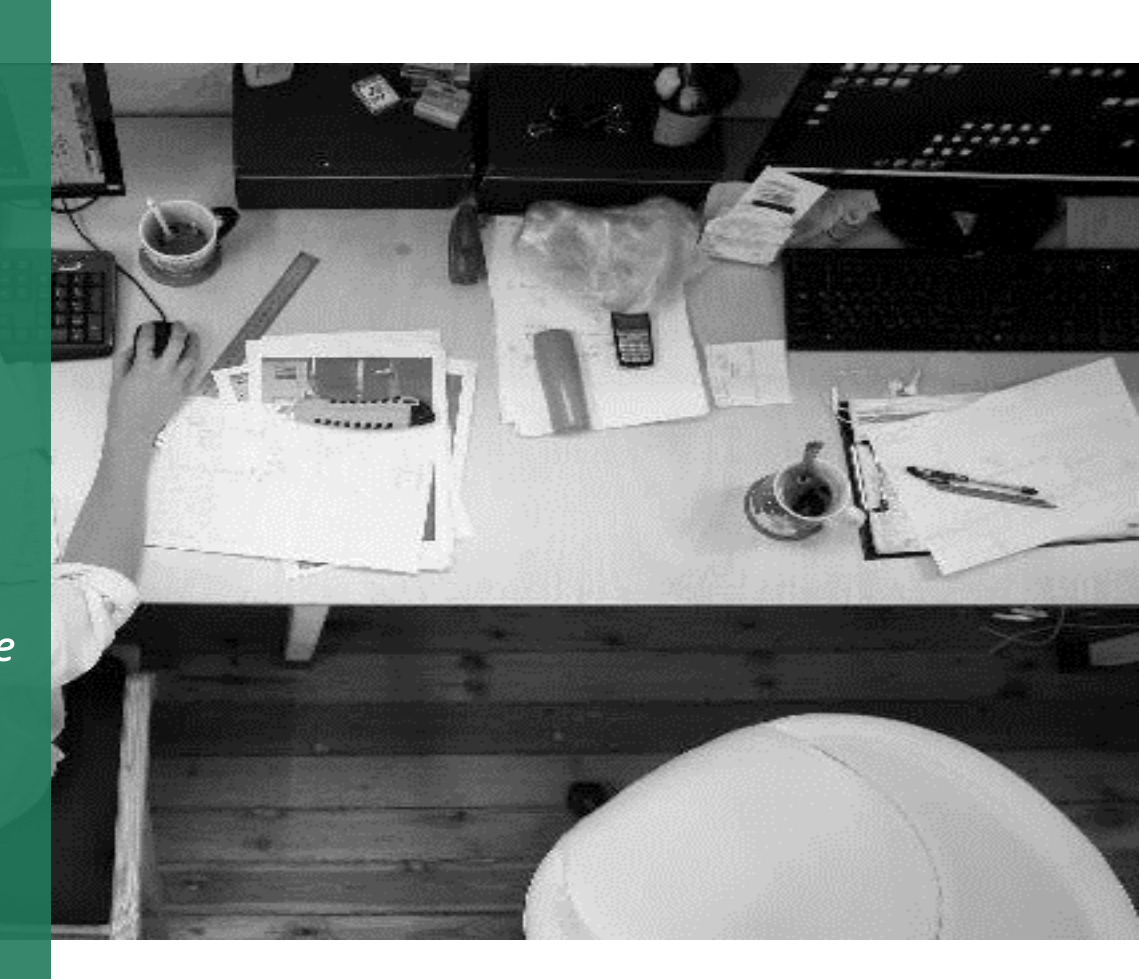
PRIVATE and Confidential. Not for DISTRIBUTION